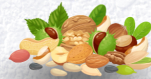
Thai northern food