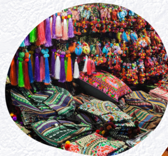
Hill tribe handcraft

Wednesday 13 November 2024, 13.30 - 16.00