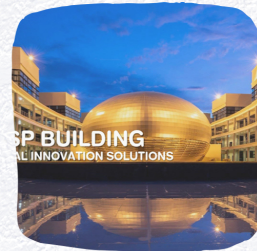
Science & Technology Park

Wednesday 13 November 2024, 13.30 - 16.00